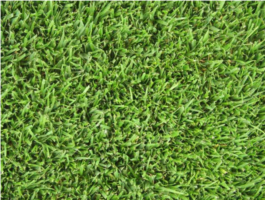
Mean Turfgrass Quality Ratings of Tall Fescue Cultivars Grown at Eighteen Locations in the U.S. Maintained using Schedule "A"

Justice is an elite tall fescue turfgrass that requires less irrigation frequency than bluegrass, ryegrass and fine fescues. Justice is a shade tolerant variety and ideal for home lawns, parks, and sod production. It exhibits outstanding wear tolerance and resists hard use on athletic fields, park and home lawns. Justice has an early spring green-up and holds its color late into the fall. Justice has performed well under low to moderate fertility, but performs better under high fertility levels associated with the maintenance of extensively used athletic fields and showcase lawns.